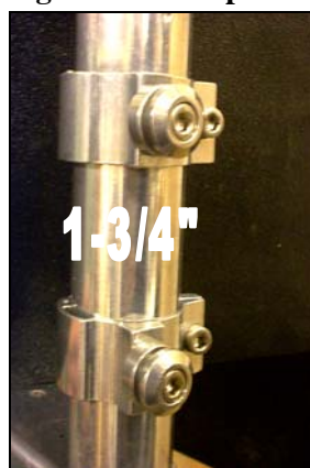
Fig. 2 fork clamps