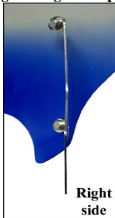
Fig. 1.2 Right side plate