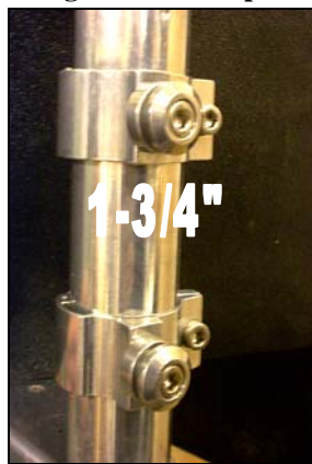
Fig. 2 Fork clamps